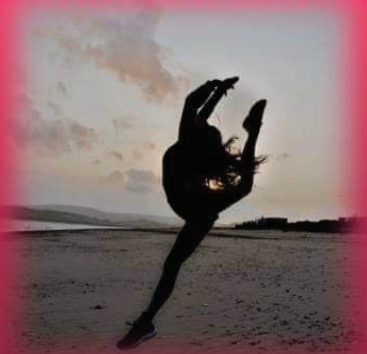
SCSD Dancer

Ballet, Tap & Disco/Street Dance Classes for children & Teenagers (Pre-school Ballet from age 2)